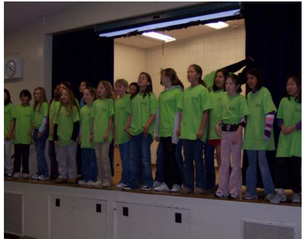
The Peace Patrol from Forest Hills Elementary School (Campbell Elem. School district) run a respect assembly.

Cornerstone Clubs are growing and we are now working in 13 districts! Students are uniting in schools in the Alum Rock, Berryessa, Cambrian, Campbell elementary, Evergreen, Franklin-Mckinley, Los Gatos, Moreland, Morgan Hill, Union, Campbell high, Milpitas, San Jose, and Santa Clara school districts.